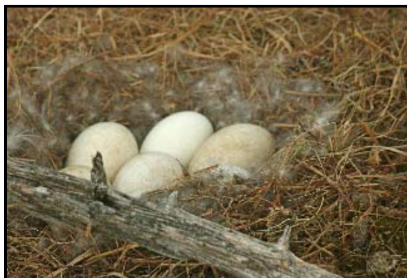
Goose Nest, Bog Pond Conservation Area, Manchester